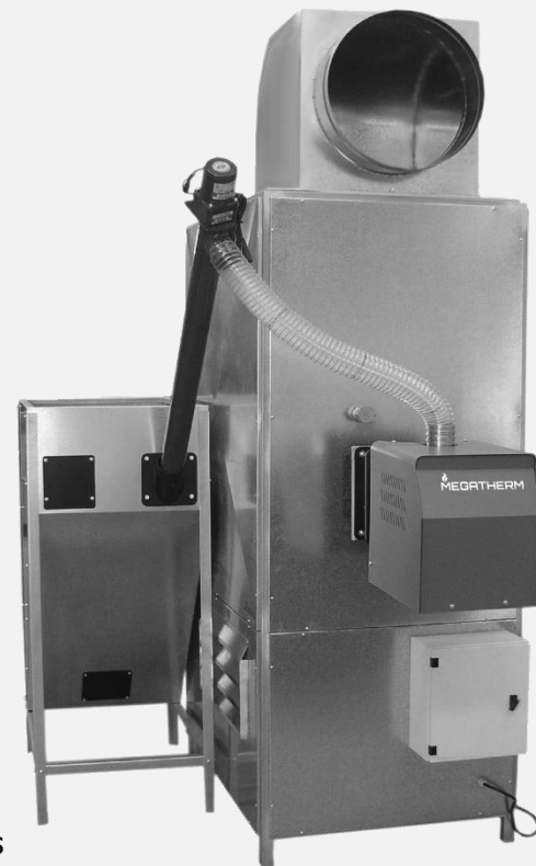
Models Notos P (pellet) Notos G (gas/oil)